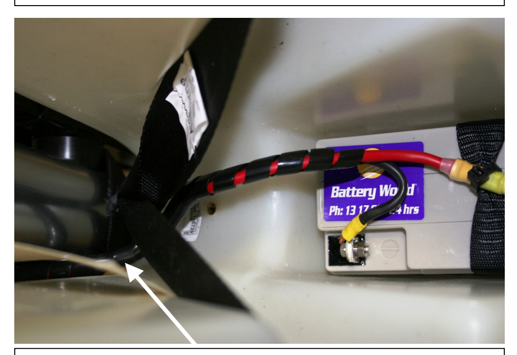
Figure 5. Chafe points minimised.