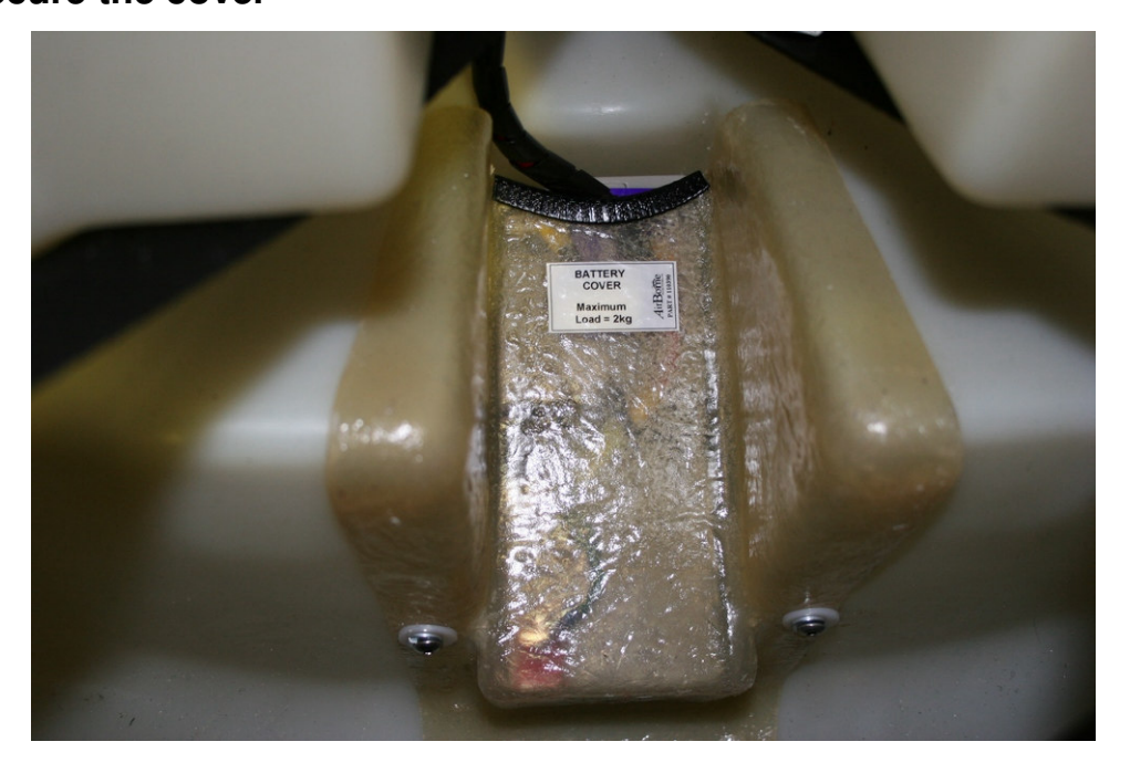
Figure 2. Secure cover into place using screws and washers. Refer to Drawing A4-7586 as included in the Retro Kit.