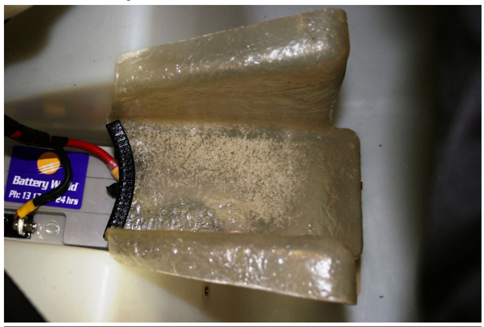
Figure 1. Place cover in the well above the battery. Check for interference.

Note: Refer to Drawing A4-7586 as included in the Retro Kit.