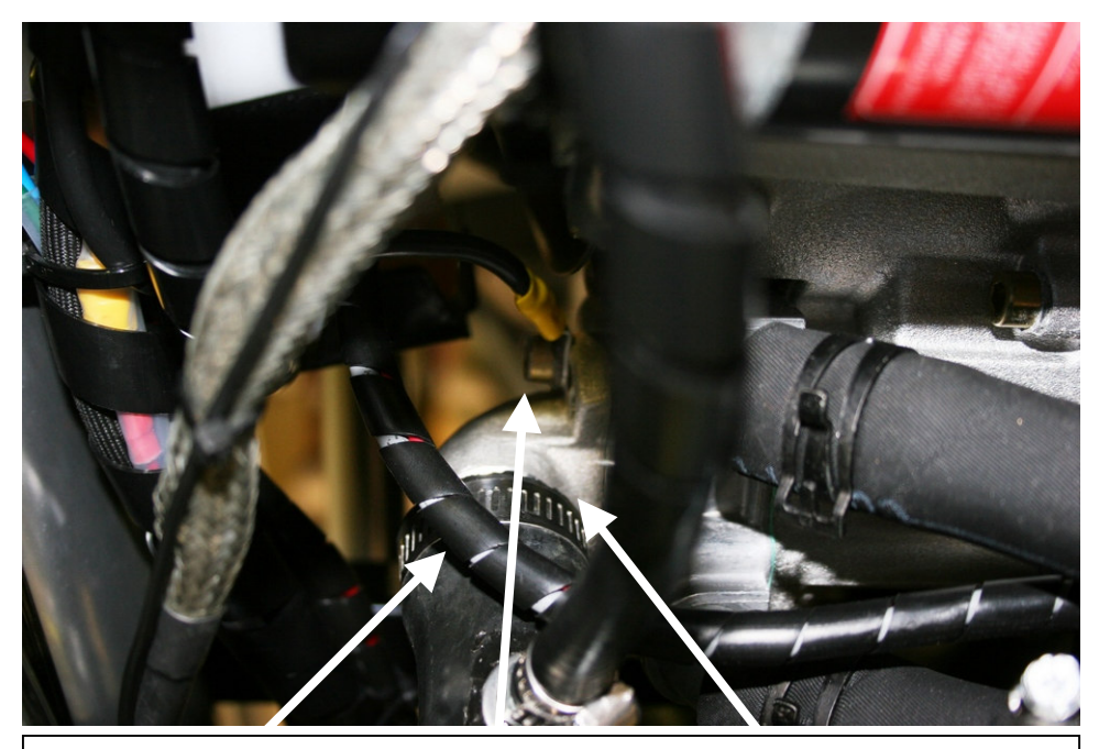
Figure 6. Ensure wiring other than engine earth lead is clear of water pump.

Confirm that wiring other than the earth lead is clear from the water pump and that there is no chafing or chafe points.